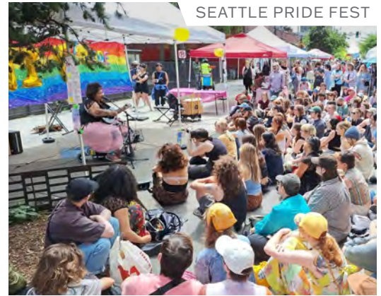
SEATTLE PRIDE FEST

Expanding safe, effective and reliable transportation options for downtown and Seattle is a top priority for DSA. They are working to improve neighborhood connections, creating more commuting options and ensuring a great urban experience.