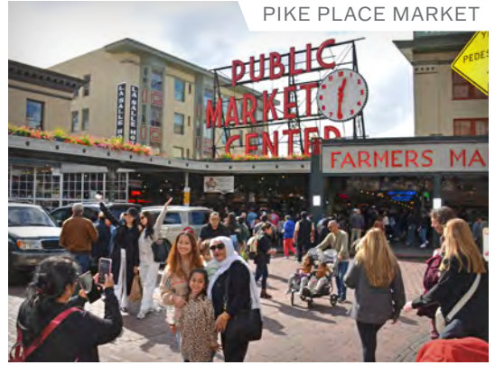
PIKE PLACE MARKET

Seattle is clean, green and vibrant: a city for all seasons. Visitors can ski in the winter, hike in the spring, sail in the summer and cycle in the fall — all just a short hop from downtown.